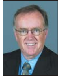
Tony Martin MP Sault Ste. Marie

Congratulations and thank you for the contribution you make to our community.